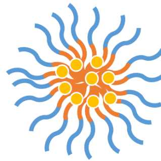
Drug-loaded polymeric nanoparticle